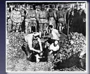
Chinese prisoners about to be buried alive by Japanese soldiers.

These categories are not necessarily as easy to define as you think!